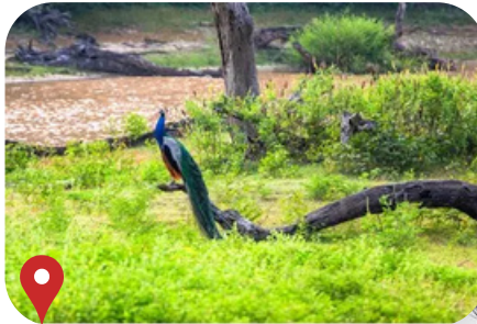
Kumana National Park

Sri Lanka Tourism Development Authority Accredited